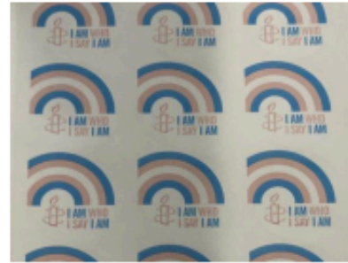
I am who I say I am sticker sheet (15 stickers)

Non-binary flag colours Order code: LGBT020