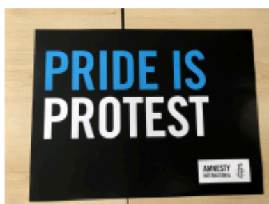
"PRIDE IS PROTEST" placard

You can do this by emailing the Supporter Communications Team at SCT@amnesty.org.uk with the quantities you need, alongside the order codes, which you can find below! Alternatively, use our online resource order form at: https://tinyurl.com/AIUKresources