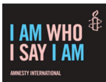
"I AM WHO I SAY I AM" placard