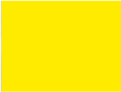
Pride sticker sheet (15 stickers)