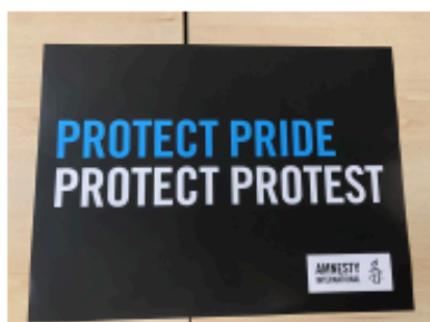
"PROTECT PRIDE PROTECT PROTEST" placard