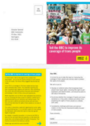
BBC trans discourse action cards