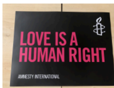
"LOVE IS A HUMAN RIGHT" placard