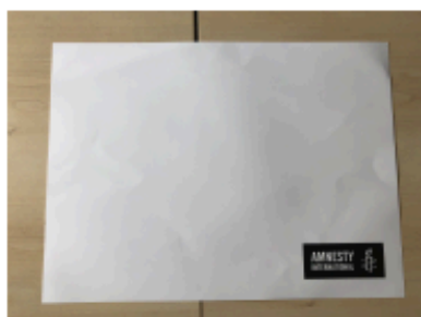
Blank (logo only) placards for photo actions

non-binary flag colours Order code: LGBT019