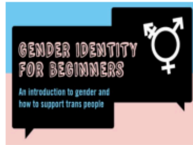
Gender identity for beginners: leaflet